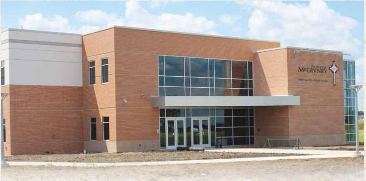
NEW BUILDING GREETES RETURNING STUDENTS — Father McGivney Catholic High School's state-of-the-art building opened to students and faculty on the first day of the school year, August 20, 2015.