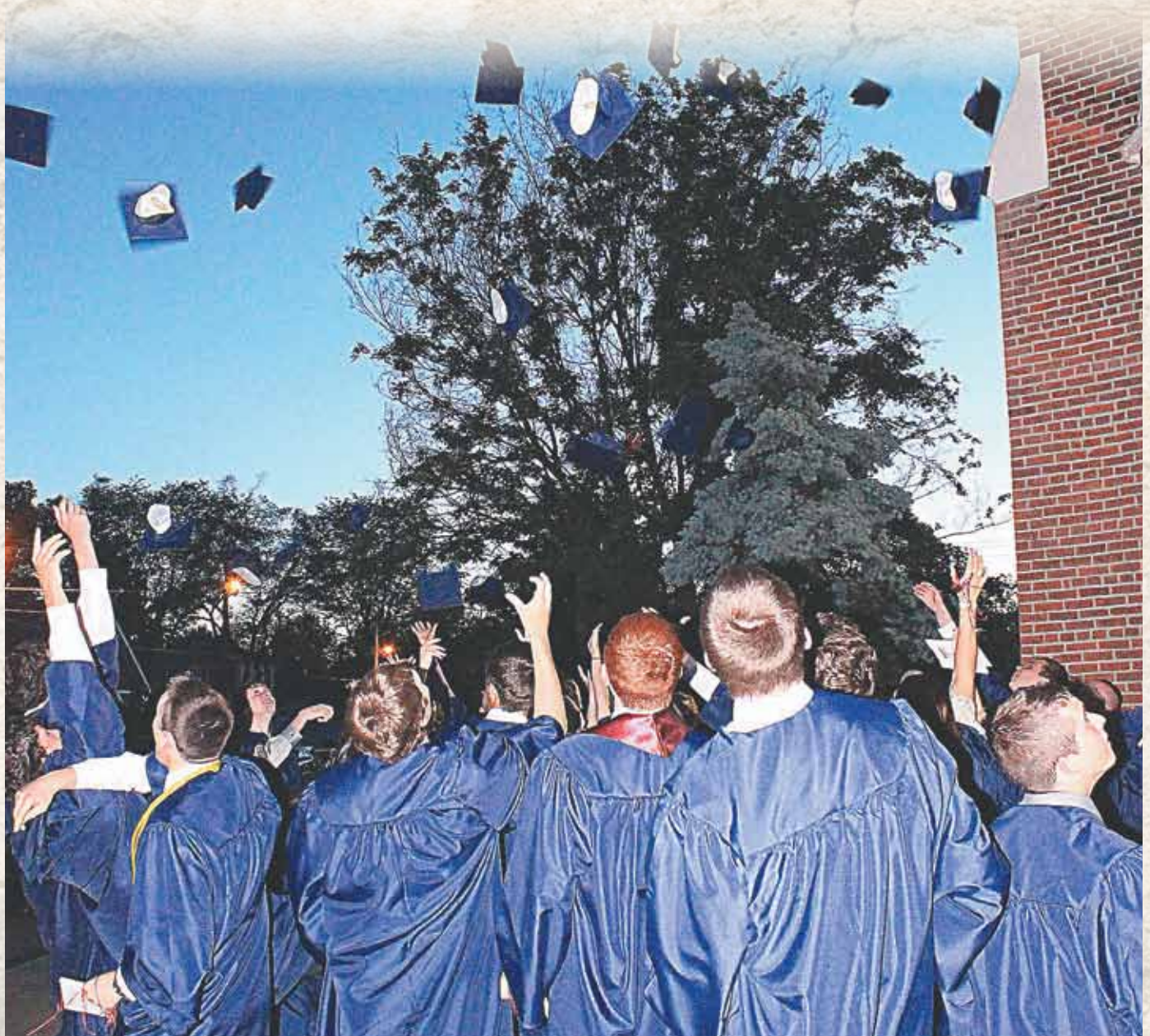
CELEBRATING HIGH SCHOOL GRADUATION — As a tradition that symbolizes their joy, graduates at St. Anthony High School in Effingham throw their caps outside of the parish church.